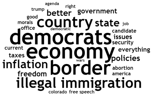
Reason to vote FOR Leg. Reps